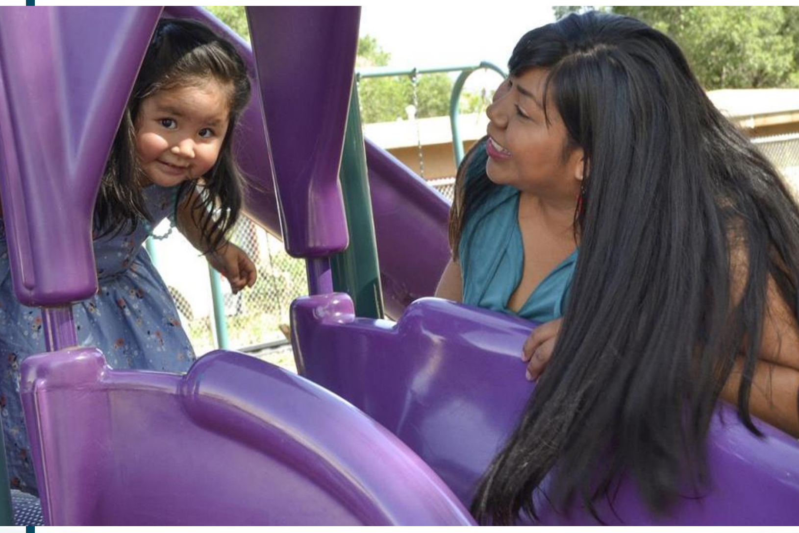
New Mexico Indian Education Newsletter Spring Edition 2022

Previously, only families at 200 percent FPL or below qualified for waived co-payments. ECECD estimates that at least 18,000 families statewide will now qualify for free child care.